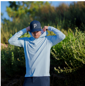
Athletic-style hoodies that are fitted and made from performance materials are permitted.