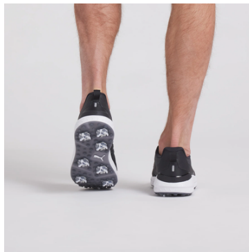
Golf specific soft spike or spike less shoes are preferred.