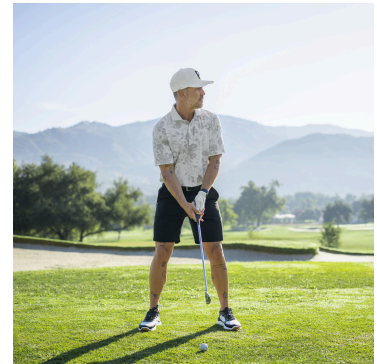
Tailored shorts of a reasonable length above the knee are permitted.