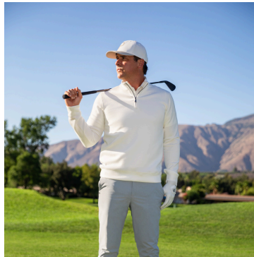
Quarter zips, vest, and knit sweaters are permitted.