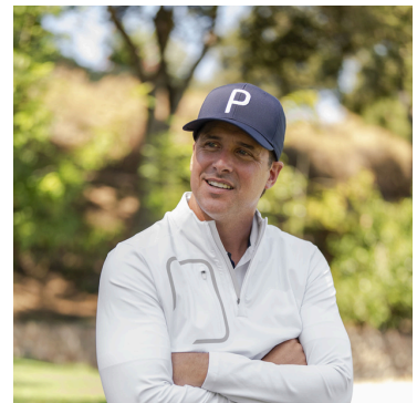
Hats must be always worn forward and removed inside the Main Dining Room.