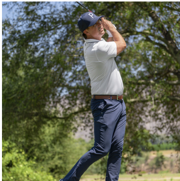
Golf shirts must be tucked in.